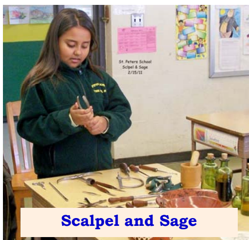
Scalpel and Sage