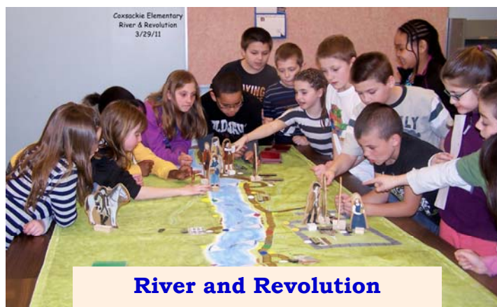
River and Revolution